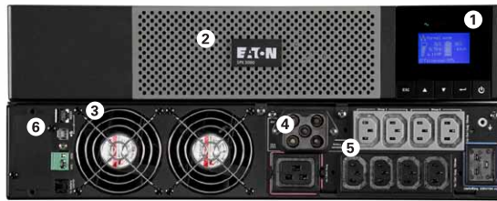
Eaton 5PX 3000i RT2U